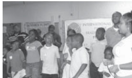
The Freedom School children really inspired the people gathered in New Orleans on October 17. We think they should record their songs on the Tapori website! You should, too!